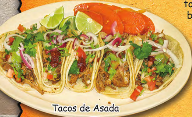
Tacos de Asada

A tortilla filled with your choice of meat.