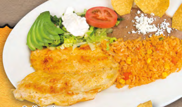
Pollo a la Plancha