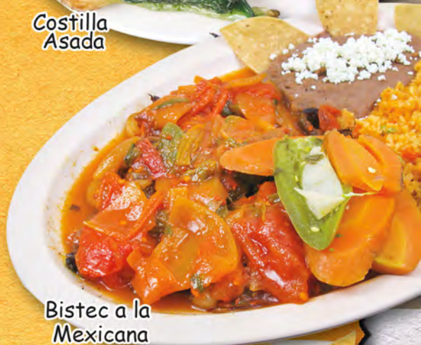
Bistec a la Mexicana