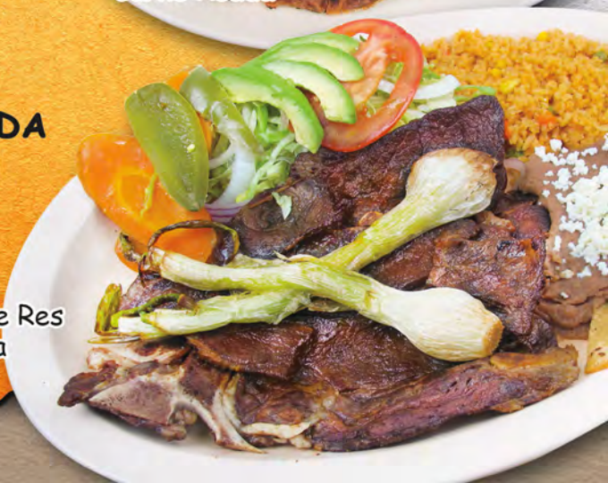
Chuleta de Res Asada