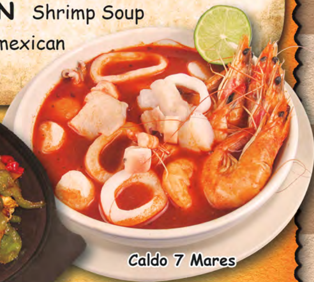
Caldo 7 Mares